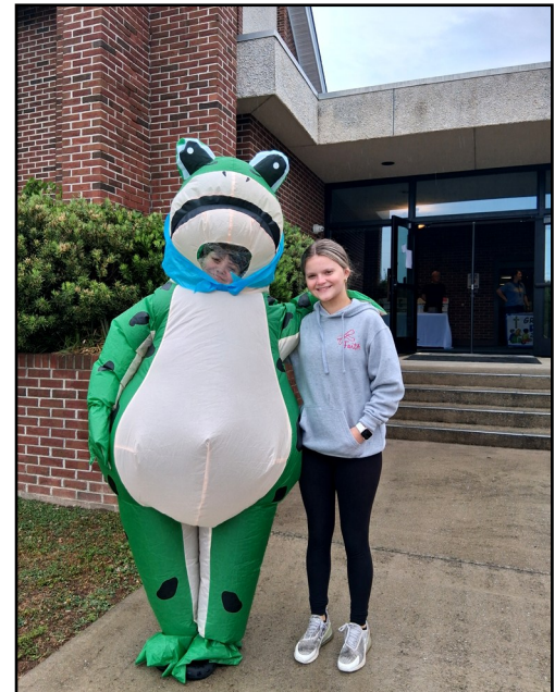
Grace Youth helping out at the May 2 nd yard sale!