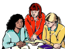
Women's Bible Study

Women's Bible Study will resume on February 5th.